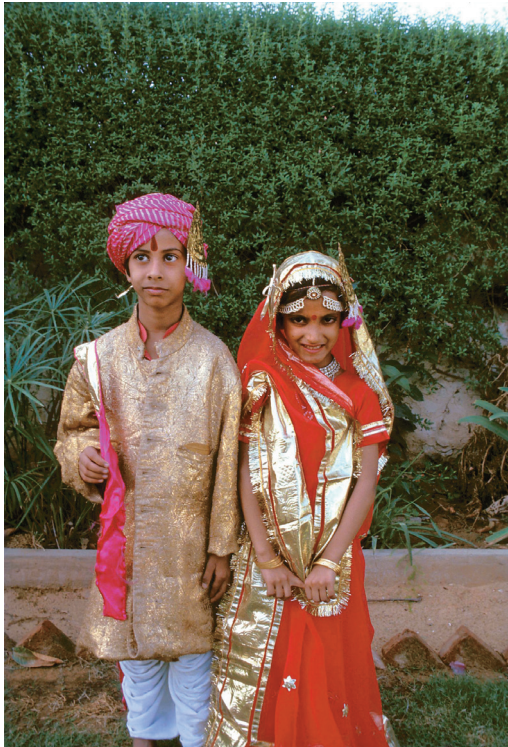
This wedding of two children in India is an example of how cultural factors play a significant role in determining the age when a particular event is likely to occur.