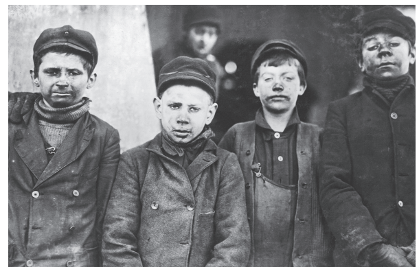
Society’s view of childhood and what is appropriate to ask of children has changed through the ages. These children worked full time in mines in the early 1900s.

cohort A group of people born at around the same time in the same place