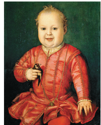
During medieval times in Europe, children were thought of as miniature, although imperfect, adults. This view of childhood was reflected in how children were dressed—identically as adults.

Several figures became central to the emerging field of child development. Alfred Binet, a French psychologist, not only pioneered the study of children's intelligence but also investigated memory and mental calculation. G. Stanley Hall pioneered the use of questionnaires to