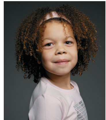
The face of the United States is changing as the proportion of children from different backgrounds is increasing.