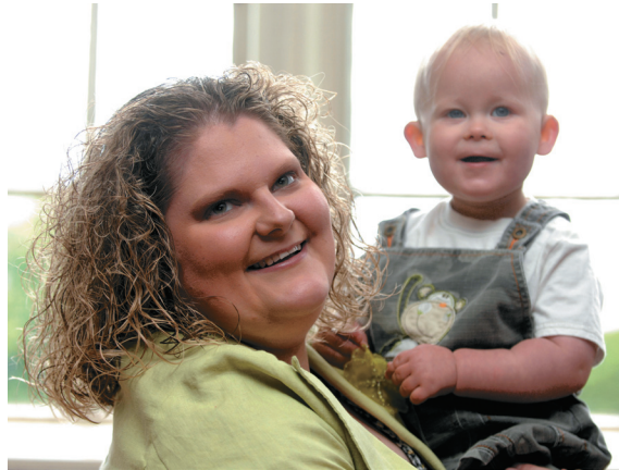
Louise Brown and son.